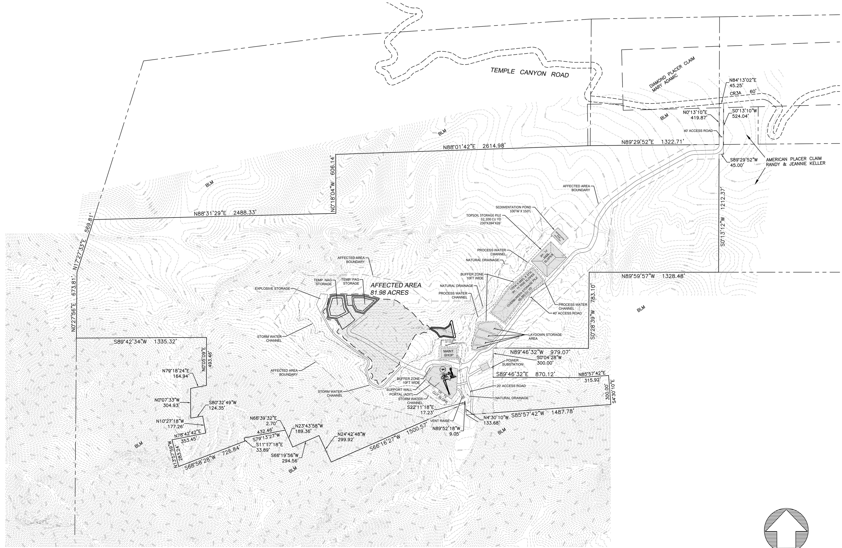
EXHIBIT C.3.2 DAWSON MINE MINING PLAN MAP OF THE AFFECTED LAND FREMONT COUNTY, COLORADO